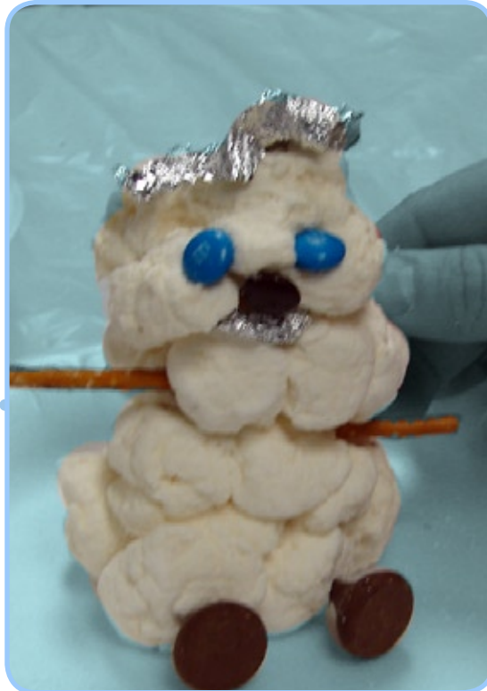
The children said he could laugh and play ...

If you can't tell already, we here in Warren sure do like to have a good time. Who knew such simple things could combine to bring about so much fun? If nothing else, the endorphins released through our laughter should fight off any flu bugs that want to try and bring us down!