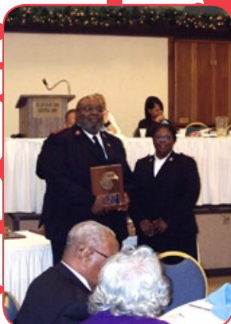
After nearly 10 minutes, they finally decided he would hold the award.