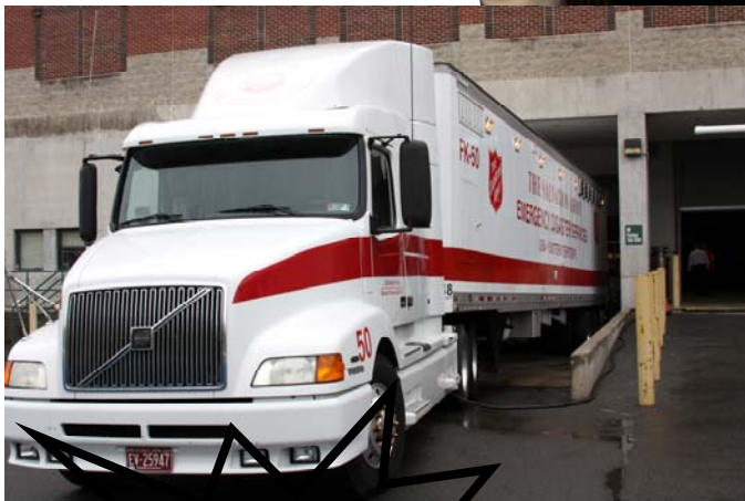
Eastern Territorial Field Kitchen