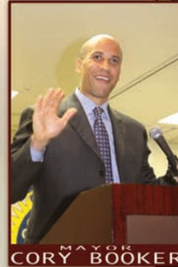
MAYOR CORY BOOKER

We want to give credit to Mayor Cory Booker who had the vision for such a center to be available to the grandparents of Newark and Essex County. With the support of the Nicholson Foundation, The State of New Jersey Kinship Navigator Program and our faithful individual donors, families will flourish and communities will be stronger through the Essex County GrandFamily Center.